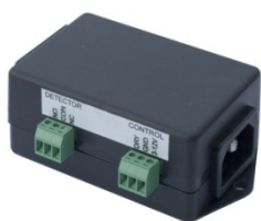
PowerEgg 600 237