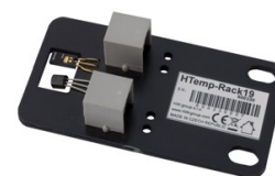
HTemp-Rack19 600 330