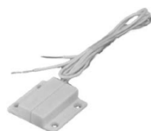
Door Contact 600 119