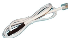
Temp-1Wire 1m 600 242