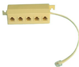
Poseidon T-Box 600 040