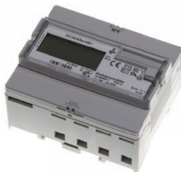
ED 310.DB HWG