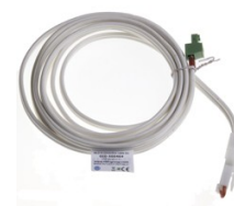
WLD A connection cable 2m 600 464