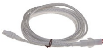
Water leak extension 2m 600 418